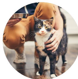
CTV Interest + Intent